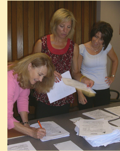
Committee members work to review applications for assistance in June 2008.