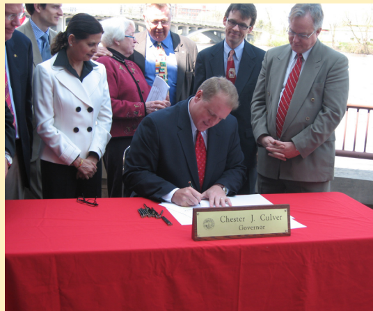
Governor Culver signs Senate File 2430, allowing organizations such as ICUF to offer an Individual Development Account program.

Obtaining state funding was the focus of the lobbying effort, as the legislature had not appropriated funding for IDA programs in a number of years.